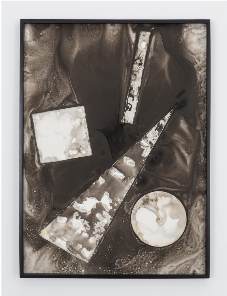
Untitled (Sand Bar) . 2014 India ink on Mylar 41.5 x 31 in $ 5,000