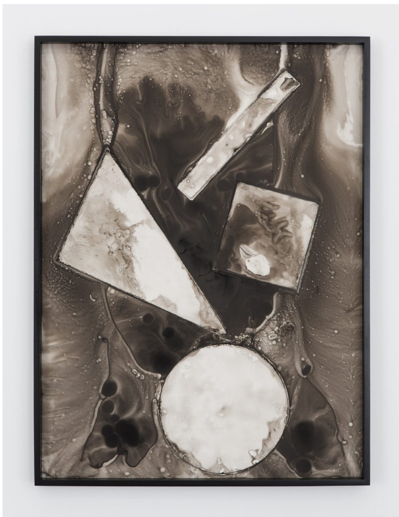
Untitled (Elemental Plumet). 2014 India ink on Mylar 42.5 x 31.75 in $ 5,000