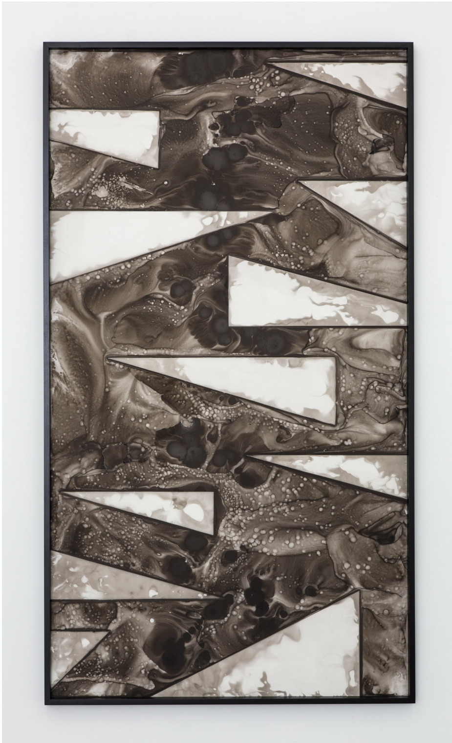
Untitled (Slippery Snook). 2014 India ink on mylar 76.5 x 43 in $ 10,000