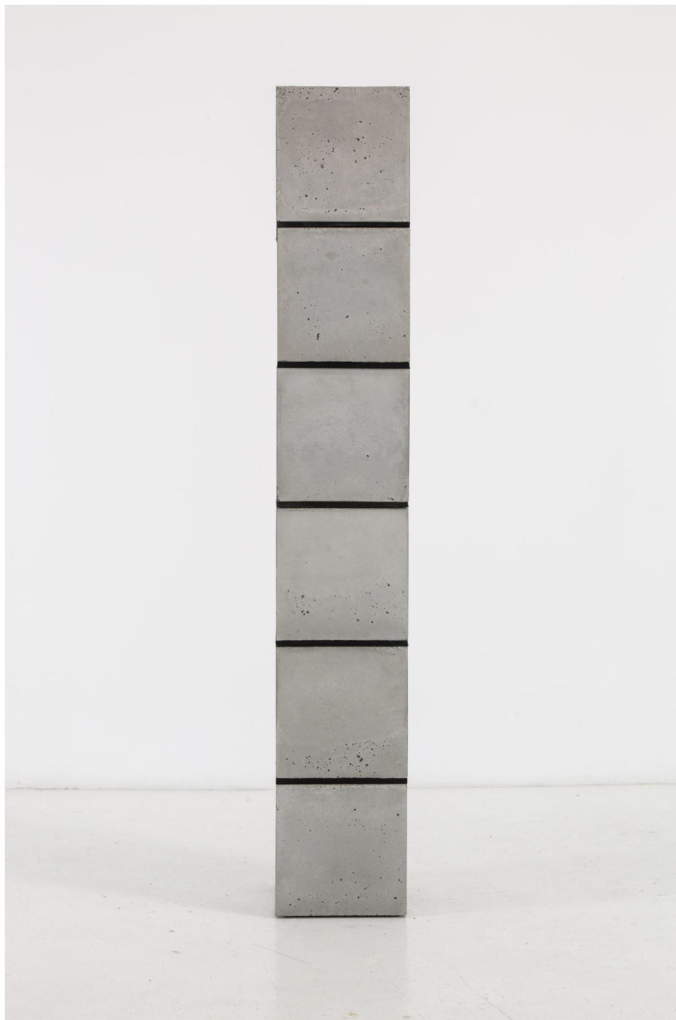
Rubber Spine. 2014 Concrete, rubber 75.25 x 12 x 12 in $ 9,000