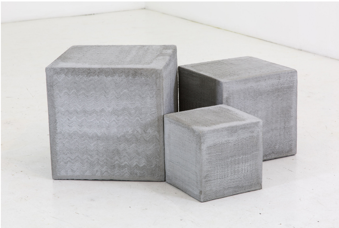
3, 4, 5, Volumes with Stucco Waves (scratch coat). 2014 Concrete, stucco, steel 20.5 x 46 x 43 in $ 9,000