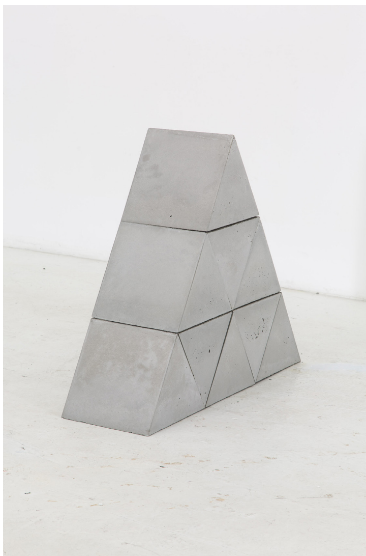
9 Triangular Blocks , 2014 Concrete 32 x 36 x 12 in $ 8,500