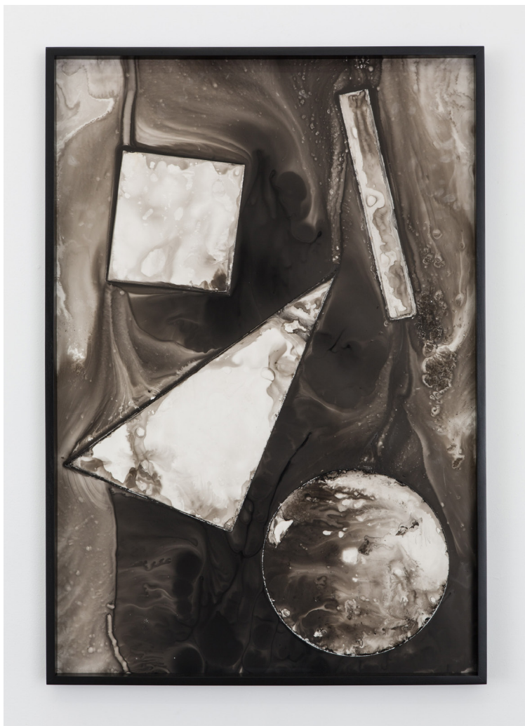
Untitled (Buoy Boogie) . 2014 India ink on Mylar 41.5 x 28.75 in $ 5,000