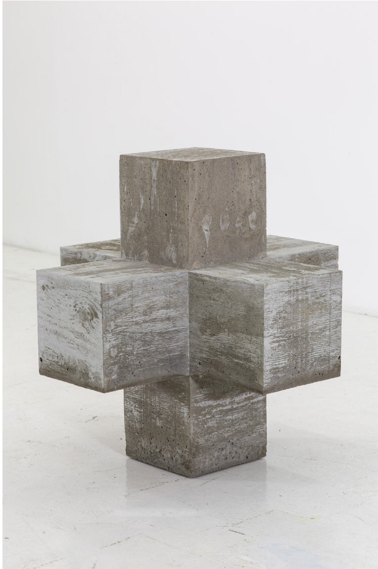
XYZ Construction #2 (symmetrical version). 2014 Concrete 36 x 36 x 36 in $ 8,500