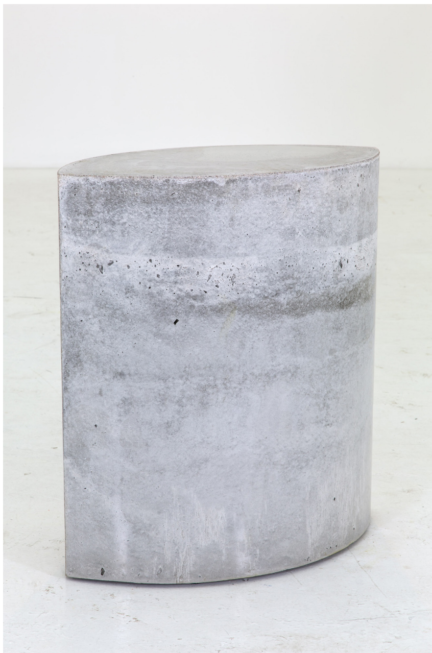
Seed . 2014 Concrete, steel 36 x 36 x 20.5 in Sold