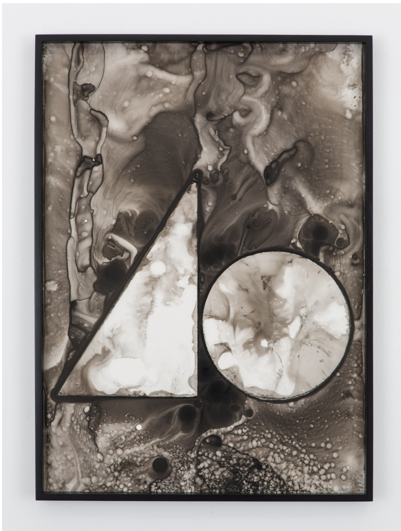
Untitled (Old Miami Logo) . 2014 India ink on Mylar 38.5 x 28 in $ 5,000